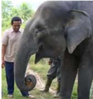
An elephant at a conservation centre enjoys its supplements: rice, corn and vitamin-mineral mix.

The Elephant Family is a UK based charity which works across Asia to save the Asian Elephant. Populations of the docile Asian giant face almost certain extinction in every place they exist in the modern world. The main threat to their existence is encroachment on their habitats and migratory routes by ever-expanding human development. Numbers are further decimated by ivory poachers, illegal capture for work or tourist camps, and hunters seeking elephant hide, meat, or teeth.