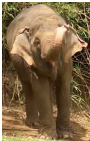
Pang Puang Phet had been living in the back of a 6 wheeled truck and making a living by walking the streets selling small amounts of sugar cane, which were then fed back to her. When she first came to the Four Seasons Tented Camp she was malnourished and ate for three days, unable to believe in a never ending supply of sugarcane! She is now fat, happy and always up for a photo shoot!

Past CAFAmerica grants have contributed to free veterinary care for 53 elephants in Northern Sumatra, training of local elephant mahouts, and improved knowledge of elephant husbandry at five elephant camps. As a result, general elephant welfare has improved, as has awareness of the plight of the Asian elephant.